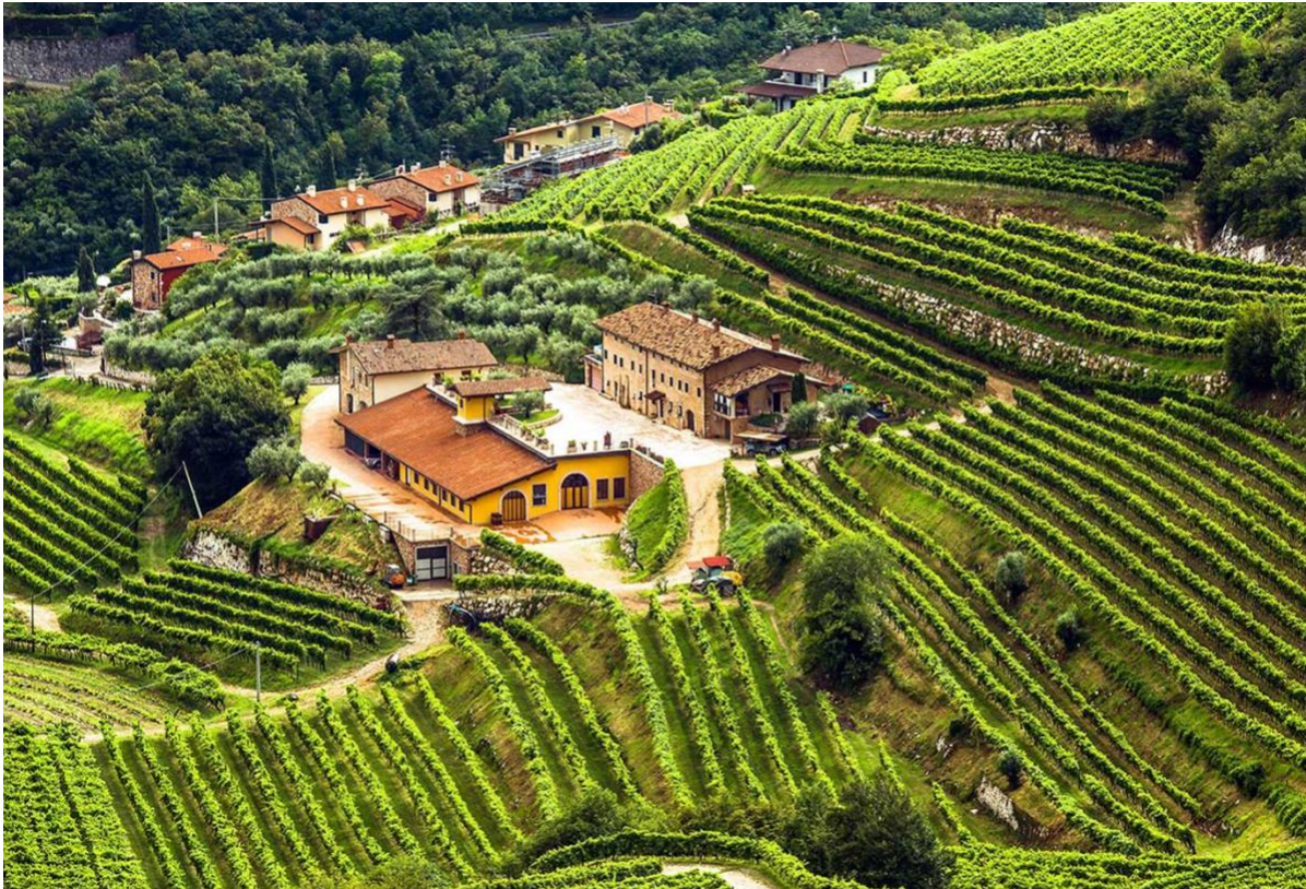
A typical Valpolicella landscape with terraced vineyards on the steep hills along the various valleys, supported by the marogne (dry walls traditionally made out of volcanic rocks).