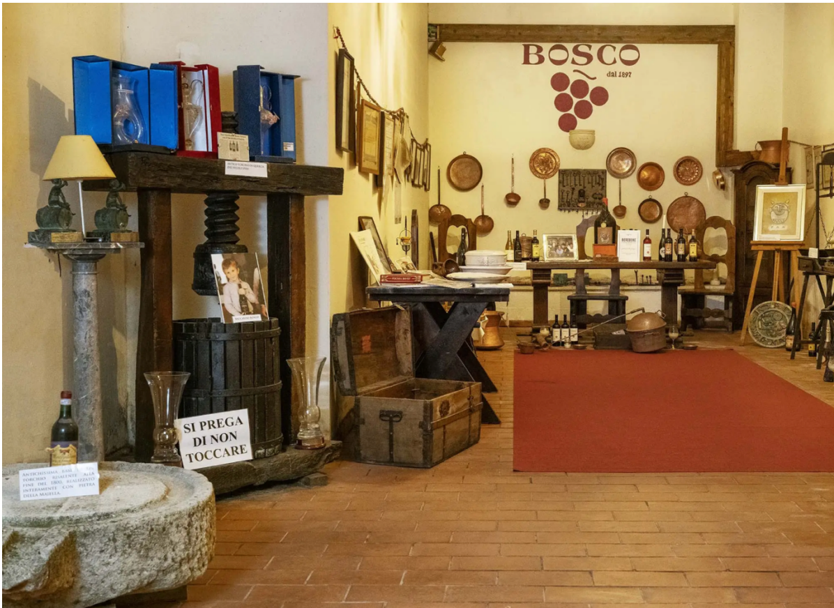
Above: the wine museum at Nestore Bosco Winery