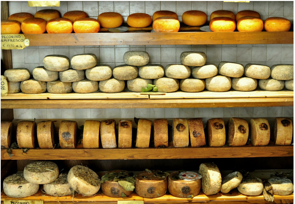
A list of Pecorino cheeses made in Italy